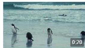
New Bird On The Beach 9 views · 21 January