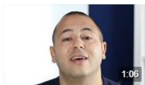
The 4 Ps of Success 51 views · 10 June