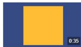
Hey Startups! 14 views · 18 March