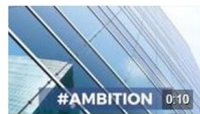
Pause the gif and the hashtag you get is what you need to do... 13 views · 6 March