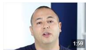
Why Fail4Wrd? 372 views · 6 June